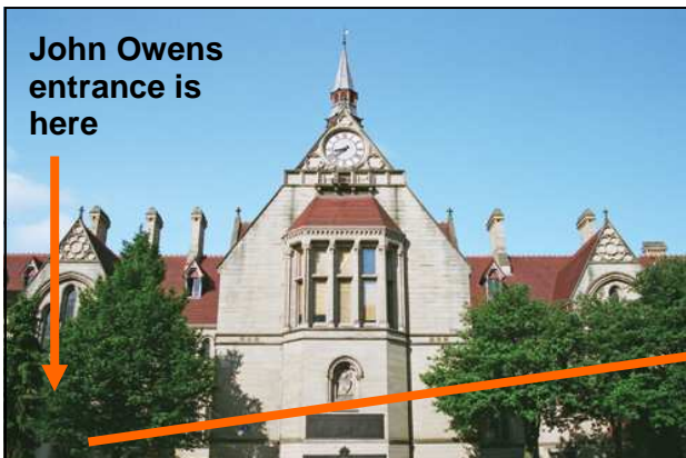
John Owens entrance is here

Go under the arch to the quadrangle and you will be faced with: