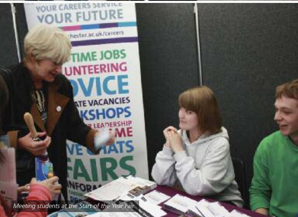
Meeting students at the Start of the Year Fair

are distinctive to The University of Manchester such as the public venues described above, the Beacon for Public Engagement, our Equity and Merit Scholarships and the high profile activities of some of our most talented public communicators.