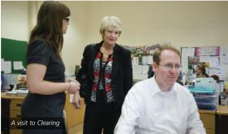
A visit to Clearing

A new academic year and a new President and Vice-Chancellor, together with the prospect of major external pressures on the higher education sector, mean that it is timely to consider our future directions, our priorities and plans - and indeed the wider values and value of this University.