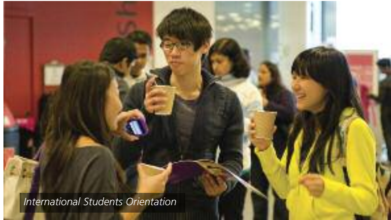
International Students Orientation