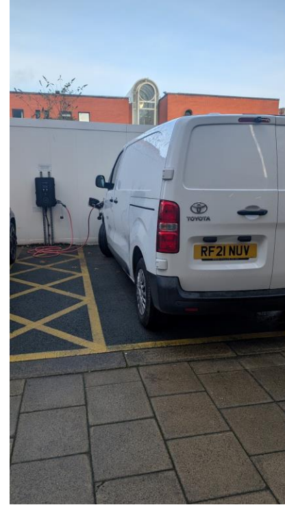
1 x dual Project EV smart charger (Catering vehicle only)