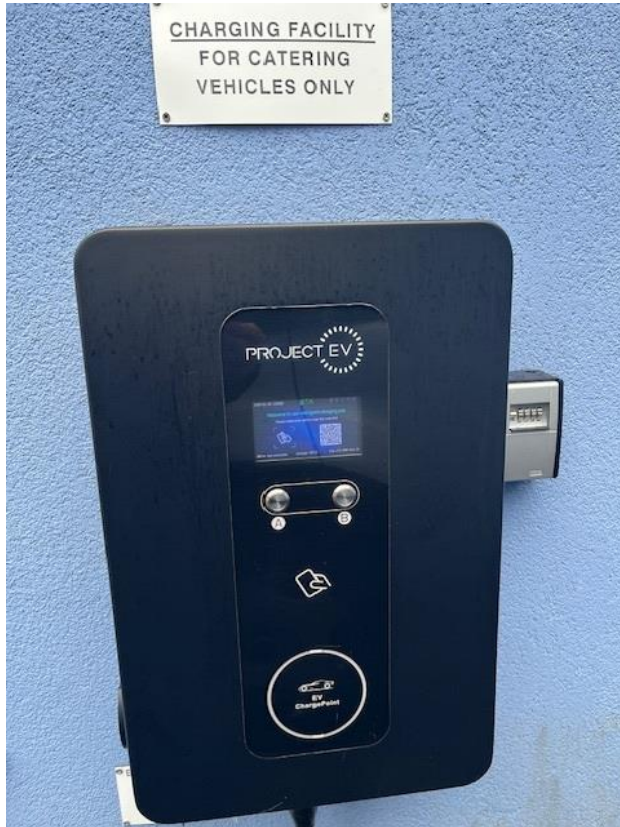
1 x public charger – for catering vehicles only