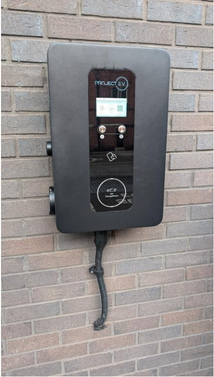
1 x dual Project EV smart charger (SEED vehicle only)