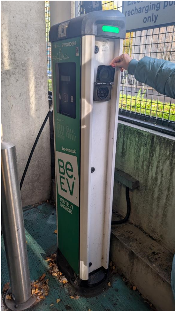
BE EV, 2 x dual smart chargers