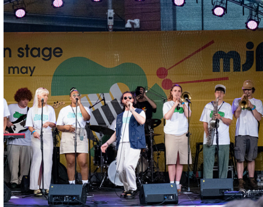
Manchester Jazz Festival