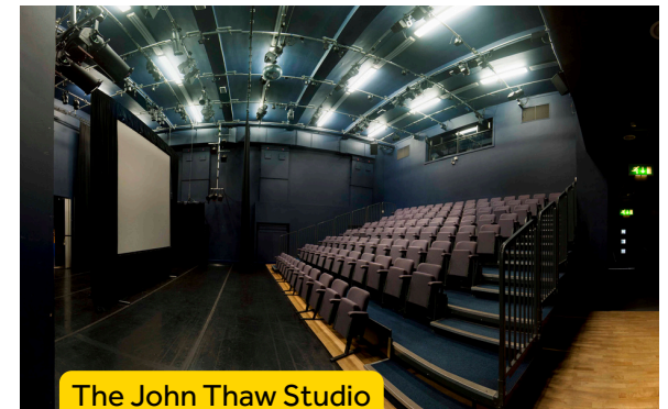
The John Thaw Studio Theatre

Students also have access to fantastic practising facilities and equipment: