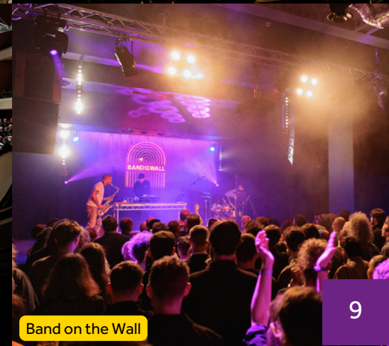
Band on the Wall