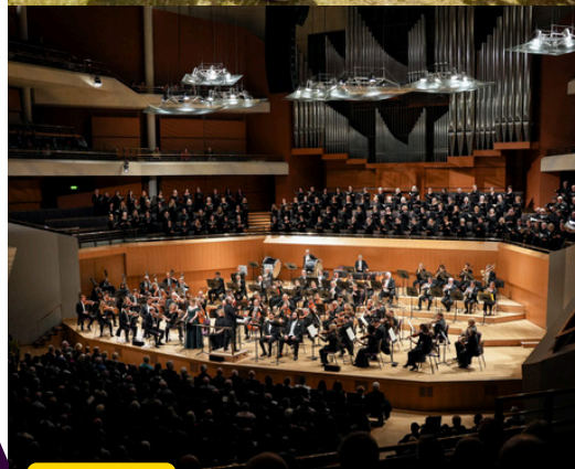
The Hallé at Bridgewater Hall