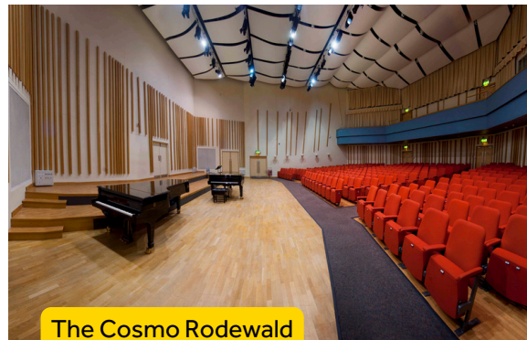
The Cosmo Rodewald Concert Hall