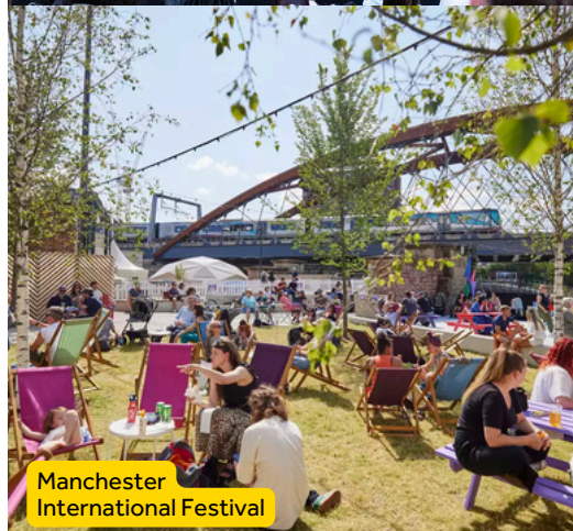
Manchester International Festival