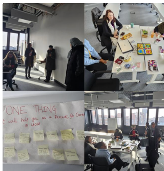
February Lunch 'n' Connect

The session concluded with a “One Thing” activity, inviting participants to share practical ideas for making life easier for families at UoM.