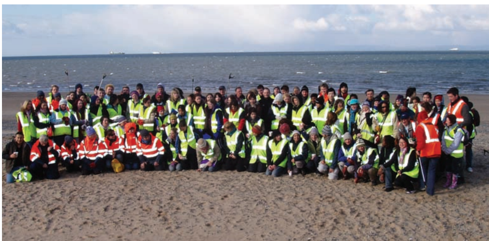
North West Student Beach Clean, Fleetwood, Blackpool

"This is a good example of the way in which Modern Biosciences can work with research institutions to provide an alternative channel from the lab to industry for drug-related intellectual property."