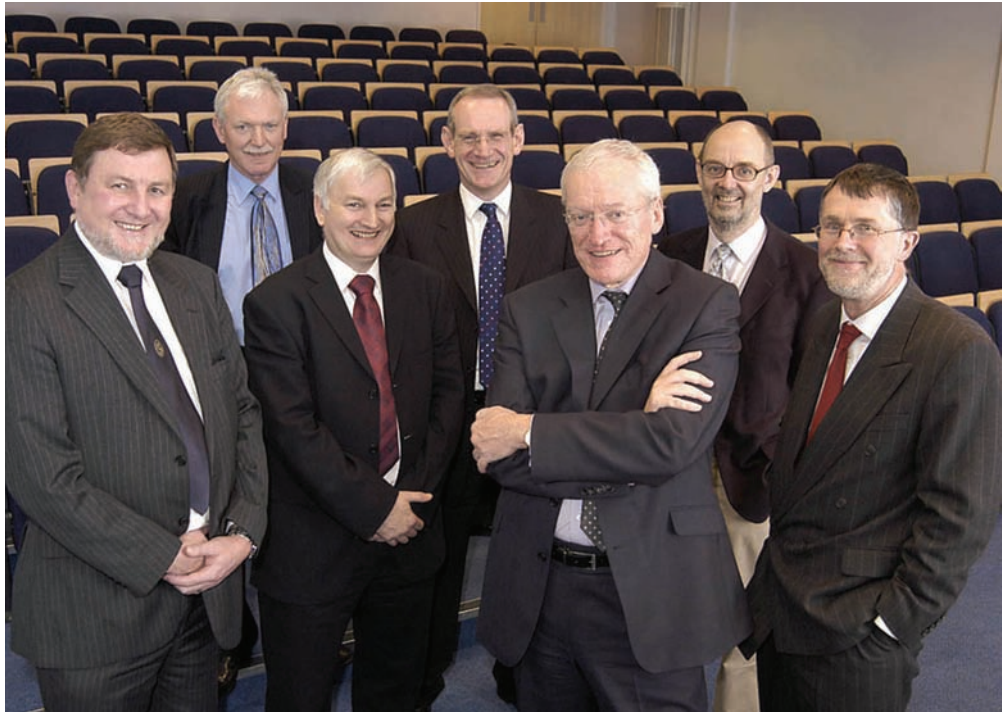
Speakers at the event