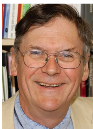
Dr Tim Hunt