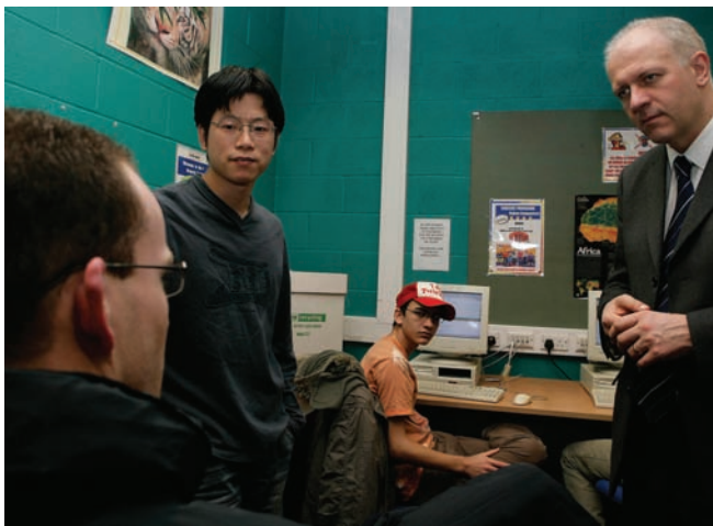
Mr Rammell meets students from the college

Bill Rammell MP, the Minister for Lifelong Learning, Further and Higher Education, officially launched the University's Foundation Year in Medicine and Dentistry at Xaverian College in Rusholme in March 2006.