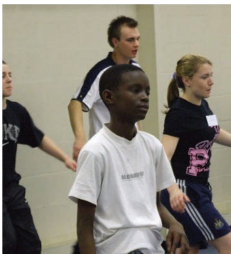
Year 9 pupils have a go at Street Dance

Students on the University's Sports Volunteer Scheme gave youngsters from local schools in Rochdale, Tameside and Stockport a taste of university life when they visited the Armitage Sports Centre on 7 May 2006.