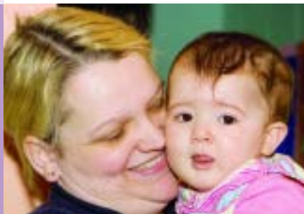
Youngsters having fun at Echoes Day Nursery

There's good news for University members of staff who have children – from next month you'll be entitled to take part in the Government's new Childcare Voucher scheme.