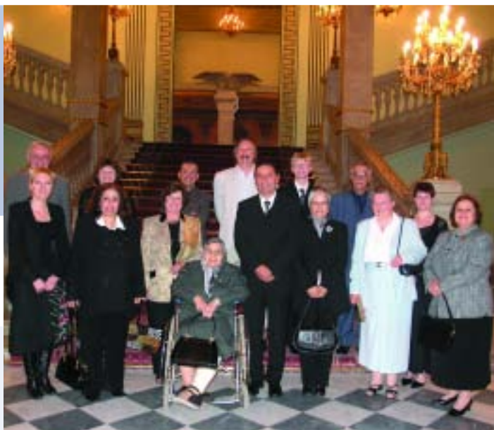
The Manchester and Cairo teams at a reception in Cairo.