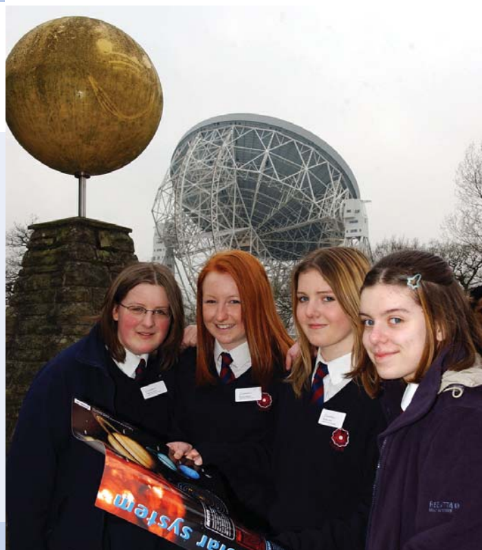
Pupils from Lancaster Girls Grammar School at the 'Spaced Out' Launch