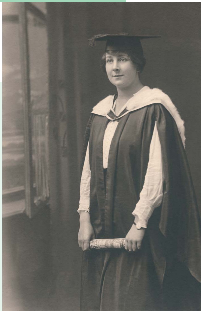
Graduation Day 1920

"About two thirds of the (Botany) students were female, and, in the earlier years (up to about 1930), the excess of females over males was more marked."