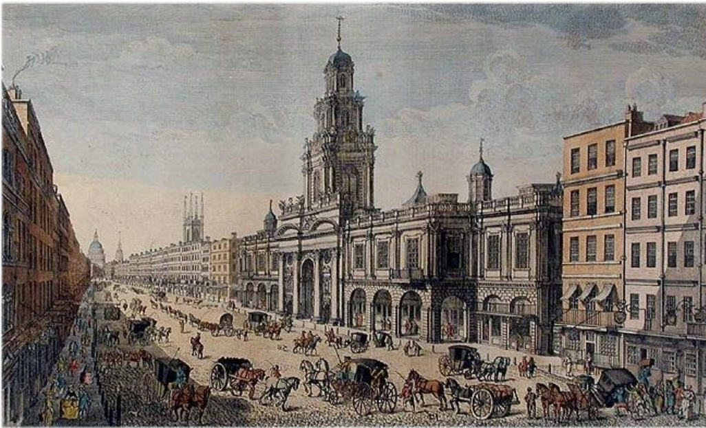
The Royal Exchange, London, by Thomas Bowles, 1781