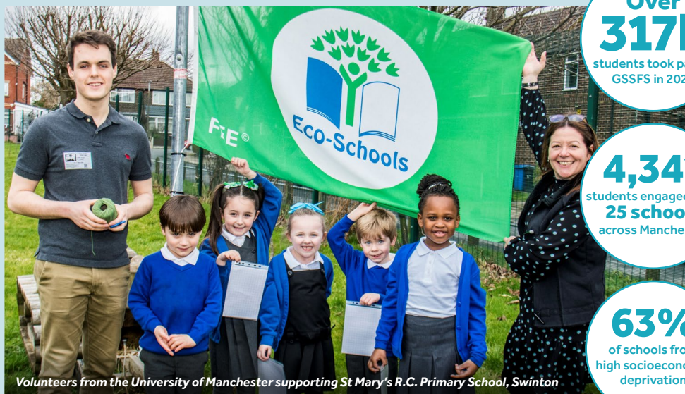
Volunteers from the University of Manchester supporting St Mary's R.C. Primary School, Swinton