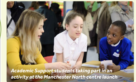
Academic Support students taking part in an activity at the Manchester North centre launch

In 2022, IntoUniversity Manchester North moved from their original site in Blackley to Harpurhey, where they have continued to strengthen their established school partnerships and embed into the local community.