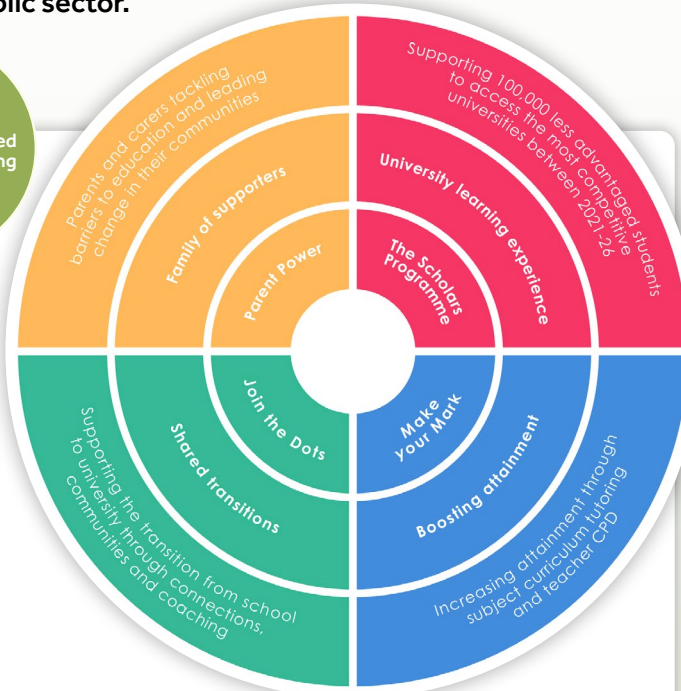
The Brilliant Club's four core programmes and their intended outcomes

25 PhD tutors delivered the Brilliant Tutoring Programme to 294 students