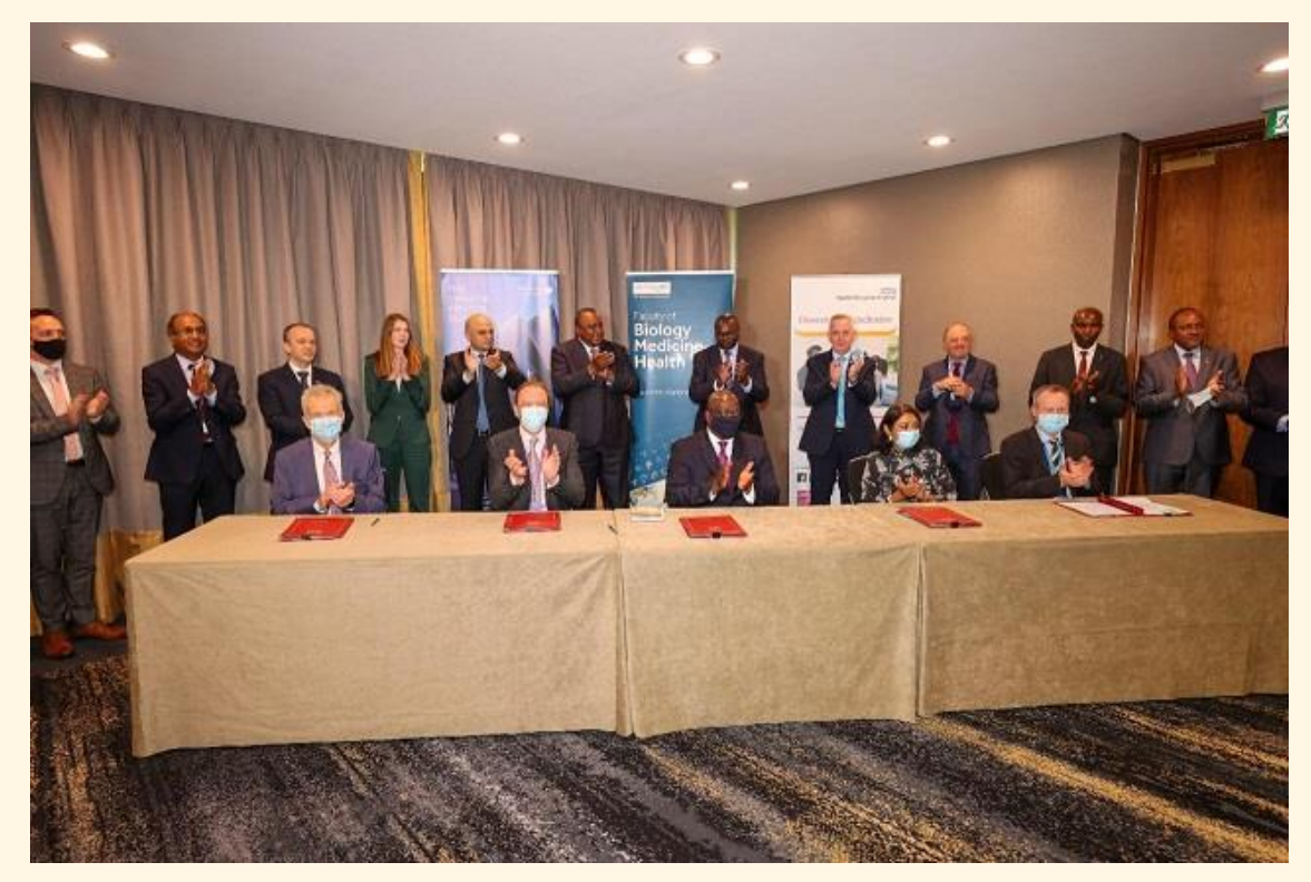
Signing of the Kenya UK Healthcare Alliance led by the University of Manchester