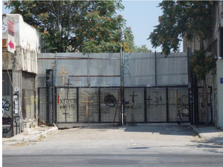
Plate 5: The entrance of the construction site for the official mosque in Athens with Christian crosses attached to the railings and the writing 'Christ has risen'.

On other occasions, when Muslims have gathered to celebrate Ramadan or the birth of the prophet Mohamed or Ashura in the central squares of Athens, in sports stadiums, or in other city centre locations, GD has reacted by arguing that it is not acceptable to allow Muslims to celebrate in public places. On the occasion of the celebration of Ashura they noted: