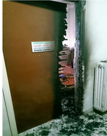
Plate 11: The attack against the Afghan Immigrant and Refugee Community of Greece on March 22, 2018

Finally, the Muslim Association of Greece (MAG) made a public announcement, that they had received a threatening phone call in January 2018 from ‘Crypteia’, stating that they are a group that burns, beats, and kills immigrants, mainly Muslims, and that MAG is among their targets. 48 All the above incidents are verified by NGOs and independent agencies. According to the Racist Violence Recording Network’s annual report, a rise of violent attacks against immigrants and refugees has been observed during 2018. 49 The most serious incident was the murder of a Pakistani immigrant in Athens in 2013 by two GD members, who were convicted of murder and sentenced to 21 years imprisonment in 2019.