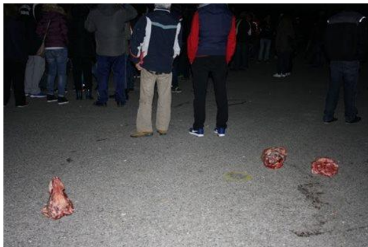
Plate 10: Pig heads thrown at a refugee camp site in Veroia (March 2016)

In other instances, attacks were targeted at immigrants and refugees. Attacks against immigrants, for example, during the second half of 2017 were on the rise in Aspropyrgos, a region near Athens, mainly targeting Muslims from Pakistan. It is estimated that around 70 or 80 such attacks took place during 2017 and, there has been evidence to suggest that they originated in the local offices of GD in the