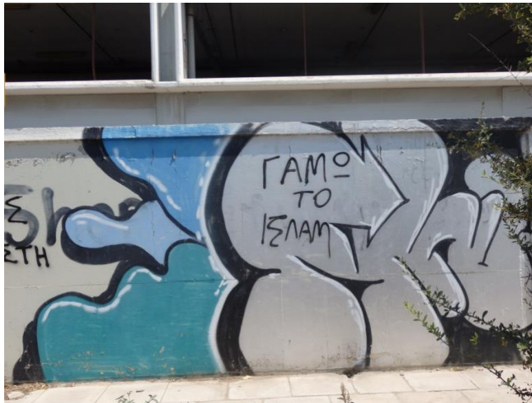
Plate 4: The graffiti on the wall near the construction site translates as, 'Fuck Islam'.