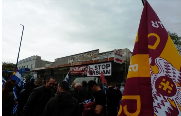
Plate 3: From a demonstration in Votanikos in 2018. Visible are a banner of 'Golden Dawn' and next to that another with the phrase 'Stop Islam'