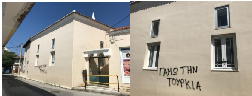
Plate 8: Defamation of the outer wall of the Iasmos Mosque with the anti-Turkish slogan 'Fuck Turkey'

The second aspect consists of physical assaults perpetrated against immigrants and refugees, the vast majority of whom are Muslims. It should be noted that due to the lack of a central agency monitoring Islamophobic assaults and violations it is difficult to categorise current incidents as clearly Islamophobic. Nevertheless, since there are many violent attacks against Muslim immigrants and refugees it would be amiss to disregard them. In unofficial personal discussions with leading figures of Muslim groups and refugee organisations, as well as with ordinary Muslims, there have been reports of attacks on Muslim women and the veil. These incidents were described as verbal assaults about the veil but not physical attacks. However, during the establishment of refugee camps around Greece, after what has been called the 'refugee crisis', a series of violent incidents started to take place. In February 2016, for example, an arson attack took place in Giannitsa, Northern Greece, by unknown perpetrators in two former military