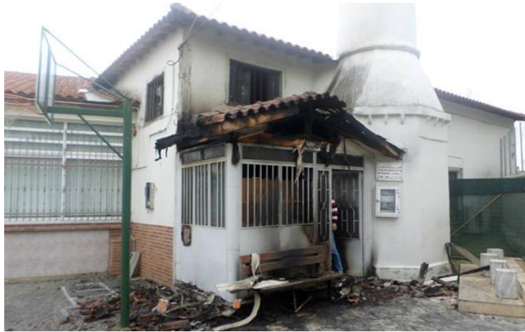
Plate 7: Arson targeting a mosque in Komotini, Western Thrace, April 2015.

which have resulted in people being injured, or throwing paint and pig heads at these sites, have been reported also in Athens. 37