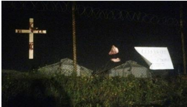
Plate 9: A cross and a pig head in Shisto hot spot (March 2016)

camps that were listed as hosting camps for refugees. 38 In February and March 2016 there were three incidents recorded of pig heads being thrown at refugee camps in Shisto (Plate 9), Veroia (Plate 10) and Pella, Northern Greece. 39