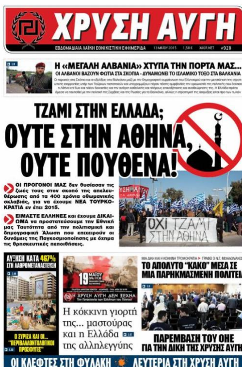
Plate 2: GD’s newspaper: ‘Mosque in Greece? Neither in Athens nor anywhere!’

They have also raised questions in parliament about the funds which will be used to construct the mosque because, at the same time, they argue that ‘ancient Greek temples and Greek Orthodox churches remain abandoned’. Additionally, they propagate the fact that many Orthodox churches in Turkey are in ruins or are being turned into mosques. In May 2015, after the government passed an amendment to the existing legislation on the construction of the mosque of Athens, GD reacted and voted against it, as they have done in all the subsequent amendments (August 2016; May 2017). They also declared their disagreement to the construction of the mosque during their annual commemoration rally for the fall of Constantinople on May 29. 28