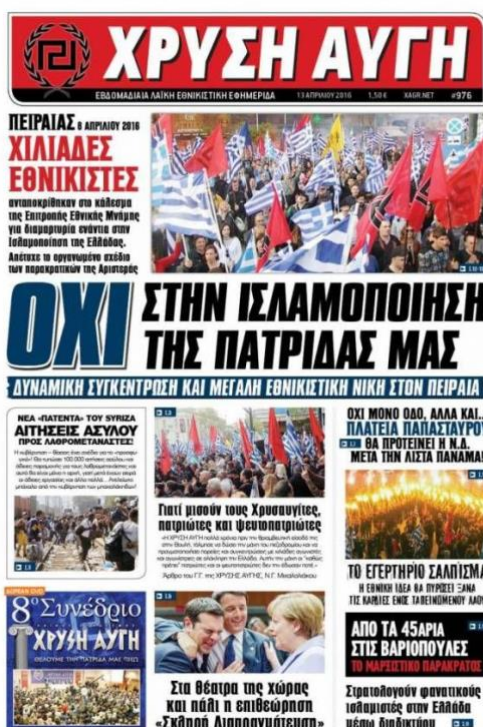
Plate 1: GD’s newspaper: ‘No to the Islamisation of our country’

[The number of] Muslims in Europe has doubled within one generation and by 2025 one third of newborns will be Muslims. These numbers cannot be questioned. Today Muslims in Europe are a minority but very soon will be the majority. [...] In Greece, if this rise of immigrants continues, Muslims will be around 30-50 per cent of the population within one generation. [...] This settlement of another race, the third-world, barbaric Muslims is the geopolitical weapon of American-Zionists in order to destroy the country’s national cohesion. 20