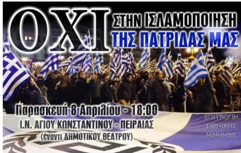
Plate 6: GD’s demonstration in Piraeus: ‘NO to the Islamisation of our country’

In April 2016, GD organised a rally in Piraeus, the port of Athens, in protest against the Islamisation of Greece in response to the refugee crisis (plate 6). The party’s call suggested that the Islamisation of Greece was underway with Greeks becoming a minority within their own country which is therefore why ‘we need to resist this de-hellenisation of our country’. 35