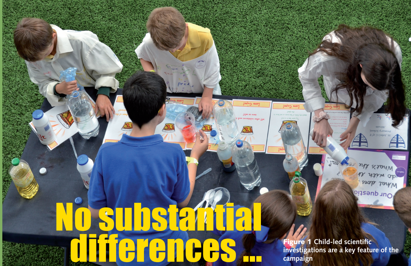
Figure 1 Child-led scientific investigations are a key feature of the campaign