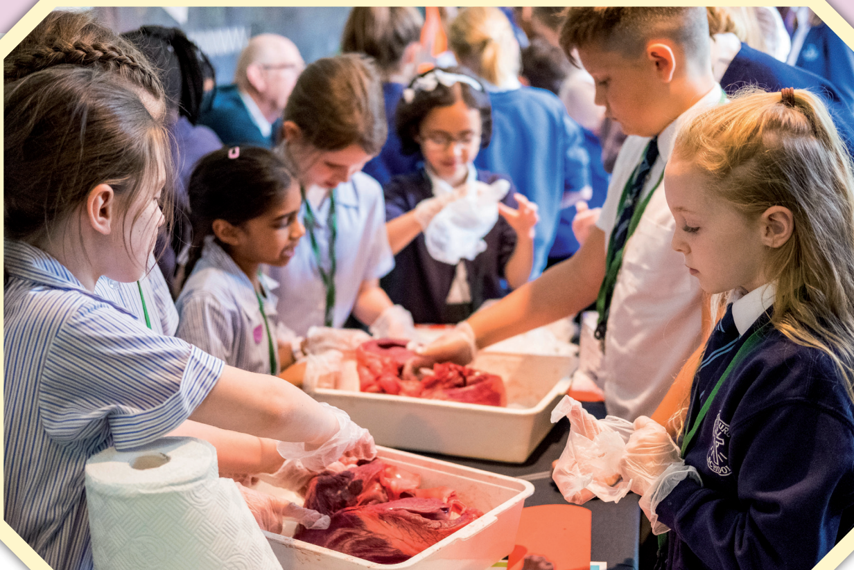
Figure 2 Being non-competitive and inclusive, GSSfs embraces all pupils

the campaign with mass engagement as a target, but not at the expense of quality science-learning experiences. I saw it as means by which teachers could come together to celebrate our subject, while also feeding and developing it by sharing practice, offering guidance and support, and opening up collaborations to enhance learning opportunities for primary and lower-secondary school children.