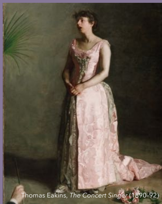
Thomas Eakins, The Concert Singer (1890-92)

Does 'women's song' exist, and if so, how can it exist in a way that doesn't simply reinforce gender essentialism? What happens to a woman's sense of self when she sings lyric song specifically, as opposed to, say, dramatic roles? What barriers need to be navigated when men's works envoicing women are performed on today's concert stages? This joint presentation focuses on two case studies: a 19th-century work – Robert Schumann's Frauenliebe und leben – and a 21st-century one – Hans Abrahamsen's let me tell you . These examples are used to examine the seemingly contradictory ways in which women sing themselves through others' music.