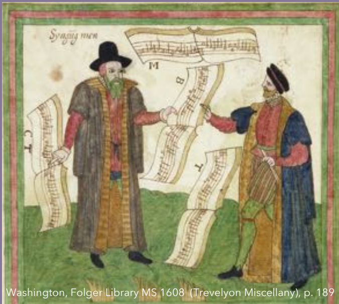
Washington, Folger Library MS 1608 (Trevelyon Miscellany), p. 189