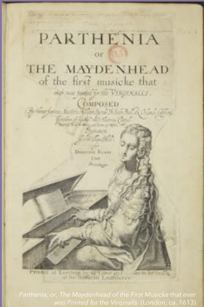
Parthenia, or, The Maydenhead of the First Musicke that ever was Printed for the Virginalls (London, ca. 1613)

This session offers an opportunity for postgraduate students in Musicology and Composition to present some of their on-going PhD research work.