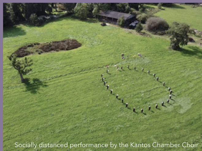
Socially distanced performance by the Kantos Chamber Choir