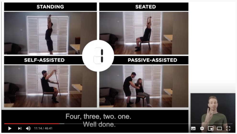
Moving with limited mobility #KeepGMMoving