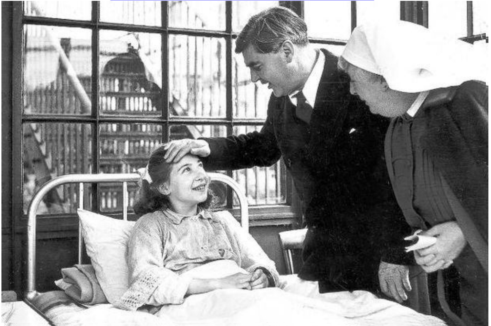
nhsengland Aneurin Bevan first day of NHS 5 July 1948 Park Hospital Manchester

http://www.bbc.co.uk/archive/nhs/5150.shtml