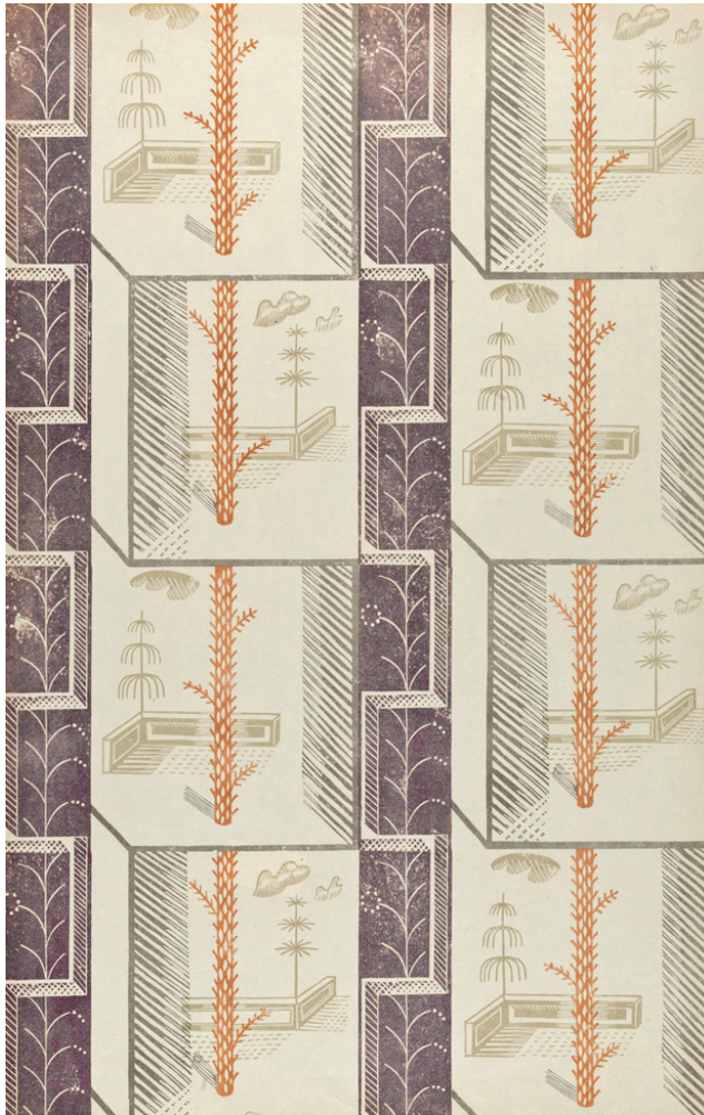
Edward Bawden, Node , 1932

Edward Bawden and Charles Mahoney - who regularly exchanged plants, seeds and gardening news with one another- were attracted, like Morris, to the transformative energy of nature, and considered the garden a prime source of optimism and regeneration. Mahoney's approach to harnessing this was distinctly democratic, his own garden plot having been described as an 'Eden' in which weeds, cabbages and sunflowers were treated with equal love and respect. Plants dismissed by most gardeners were prized as 'lilies of the field' by the artist, who strove to promote the beauty found in the most commonplace of settings, not least the ordinary suburban back-garden. Such spaces were also a great source of inspiration for Spencer Gore , who painted a number of back-yards, favouring the vertiginous vantage point of the house's first floor window. For him, this was a place to witness key scenes of modern life and appreciate nature's almost merciless ability to prosper despite the dense and polluted environment of Edwardian London.