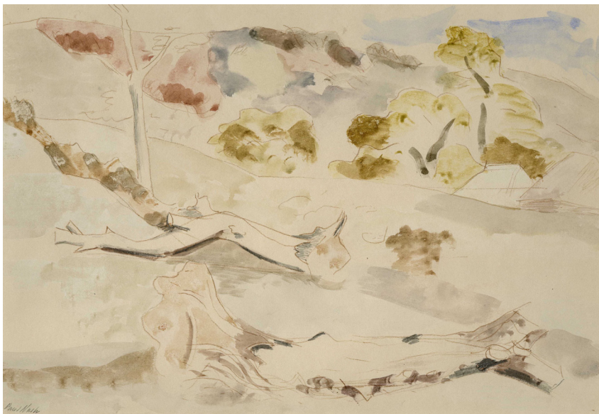
Fallen Trees, Savernake Forest, Wiltshire or Swanage, Kent 1933

In Fallen Trees, Savernake Forest, Wiltshire or Swanage, Kent (1933) by Paul Nash we see a group of trees lying forlorn, the cause of their uprooting unknown. The displaced trees appear to be slowly sinking into the landscape and will eventually rot into the earth in which they grew. 'He depicted wide-open landscapes... where ancient burial mounds struck him as England's very own version of the pyramids; he drew trees as if they were people, or perhaps guardian spirits watching over him'. 10