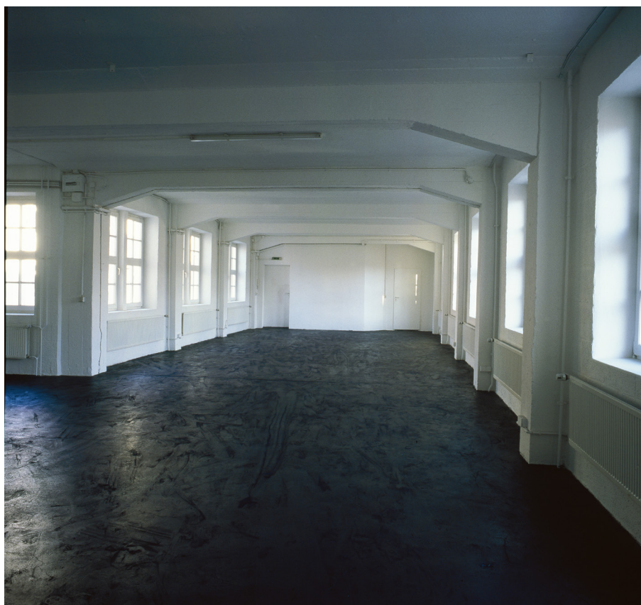
Harvest of the Winter Months 1996 © Anya Gallaccio. All Rights Reserved, DACS 2016.

Harvest of the Winter Months (1996), is one such installation, with graphite powder rubbed into the concrete floor of Künstlerhaus Bremen. Like the commission for the Whitworth, the viewer is forced to query the integrity of materials they inherently know to be solid. The graphite coating makes the concrete floor unstable; its patina changes and fades as feet walk over it; the mirrored surface of the Whitworth's stainless steel tree tricks our eye through the reflection of its surroundings. In both artworks Gallaccio revisits the traditions of Minimalist art from the 1960s and 70s with nods to the Mirror Cubes of Robert Morris, and the dense graphite drawings of Brice Marden.