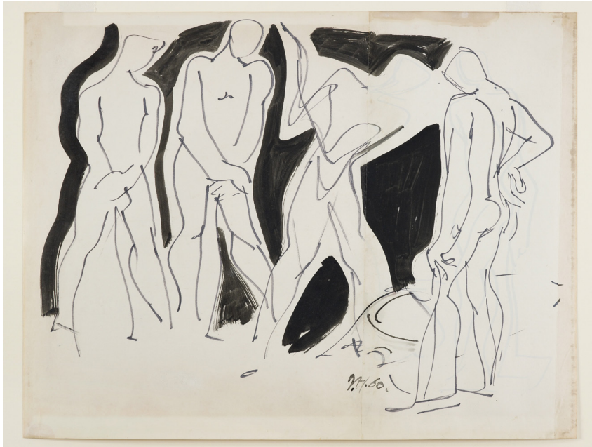
Study of Four Men Felling a Tree 1960 Collection of the Whitworth, University of Manchester.

Flailing Trees is among many works owned by the Whitworth that address the loss of trees. Study of Four Men Felling a Tree (1960) is a pen and ink drawing by artist Ivon Hitchens. It shows in a hurried and economical line the brutal act of felling a tree. One of the figures is frozen in mid-swing holding an axe aloft; the other three figures stand with heads bowed in what appears to be solemn graveside contemplation. Throughout his career Hitchens explored the landscape and trees, creating art that didn't simply document, but recaptured the emotions of a place. He once commented 'art is not reporting. It is memory.' 9