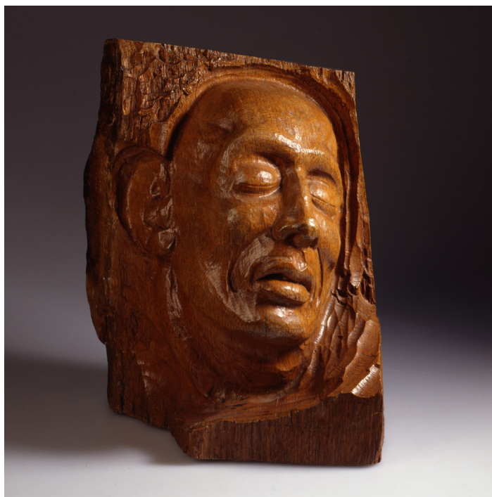
Die Letzte Gesicht 1944

One of these prisoners was the author Bruno Apitz, who secretly carved a death mask from one of the tree fragments, managing to hide his activities from the guards. This death mask is a haunting depiction of mortality, a face with an emptied expression: 'it symbolises the pain of suffering and death, and implies both the destruction of humanism and hopes of transfiguration.' 5 The person depicted was Ernst Thälmann, leader of the Communist Party in Germany; he was shot at Buchenwald by order of Adolf Hitler five days before the Goethe Oak was destroyed.