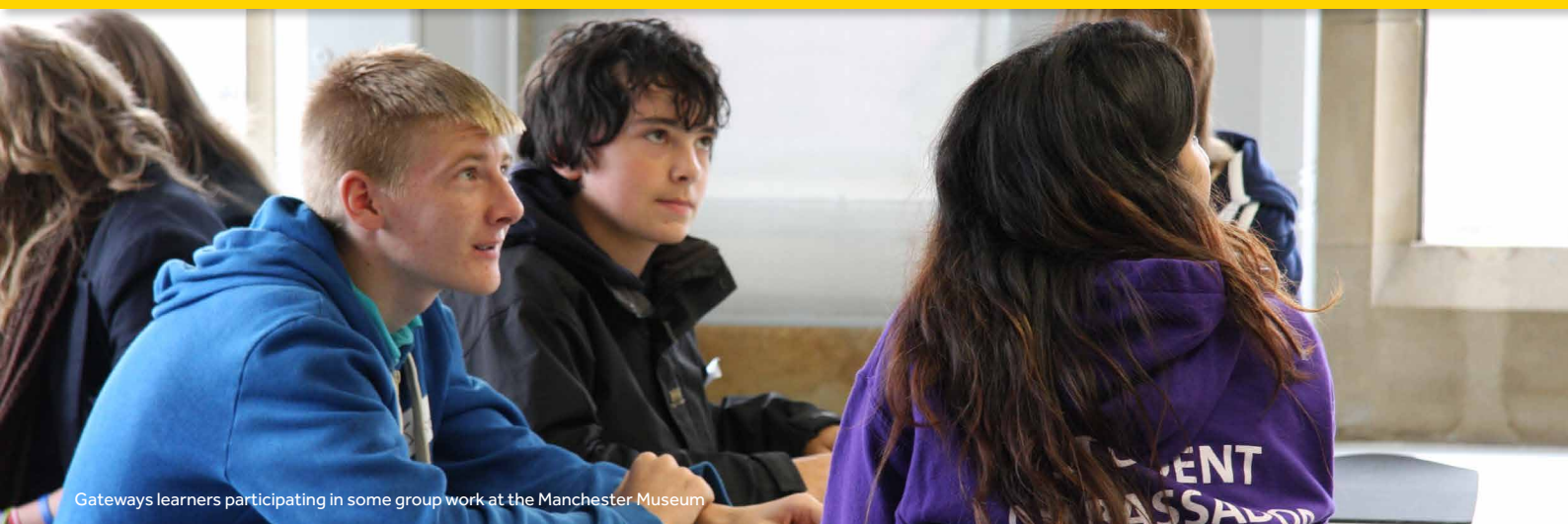
Gateways learners participating in some group work at the Manchester Museum