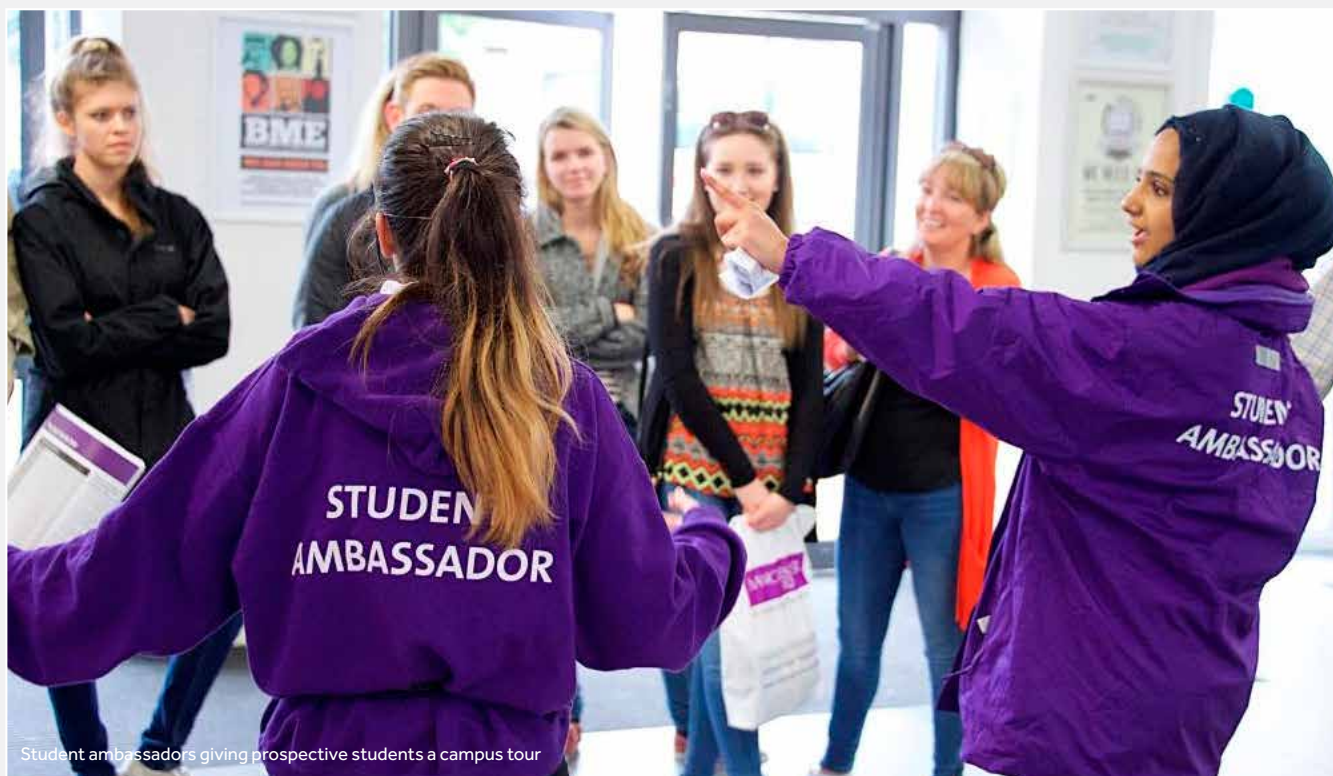
Student ambassadors giving prospective students a campus tour

Teachers of post-16 students can bring groups of their pupils to visit The University of Manchester campus, in order to get a taste of university life and experience first-hand the atmosphere of the University campus.