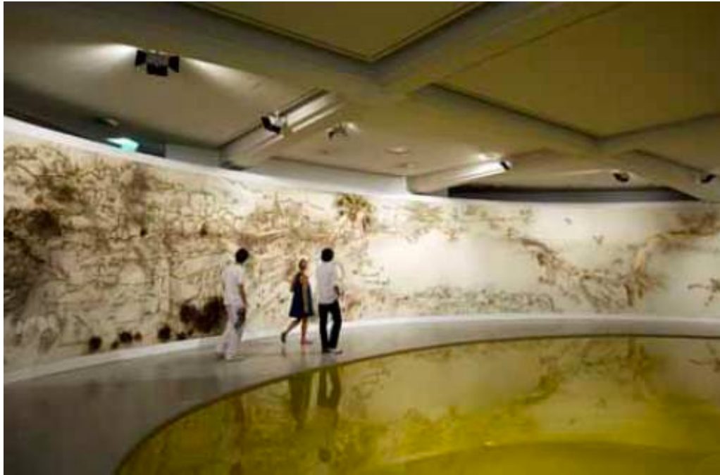
Installation view of Travels in the Mediterranean at Musée d'Art moderne et d'Art contemporain, Nice, France, 2010

In recent years, two major new works have extended this aspect of Cai's work, Heritage (2013), presented at the Gallery of Modern Art in Brisbane (pictured), seems to unite two strands within the museum-based side of Cai's practice. Like earlier pieces such as Inopportune: Stage Two (2004) and Head On (2006), it uses animals as symbols and presents a theatricalized and dramatic tableau that articulates ideas about nature and culture. Here 99 animals from around the world, including both carnivores and herbivores, gather together at the edge of a large watering hole and drink together. Man is conspicuously absent, and the scene seems edenic, a vision of a world in which all species peacefully co-exist, a kind of gallery-bound ark. In contrast, Silent Ink (2014), presented as part of Cai's exhibition The Ninth Wave at the Power Station for Art, Shanghai, consists of a 250 metre square lake excavated out of the gallery floor and filled with 20,000 litres of black ink. This is a monumental, spare and powerful work. Unaccompanied by drawings, the pool of ink is a singular object of contemplation, both mirror and void.