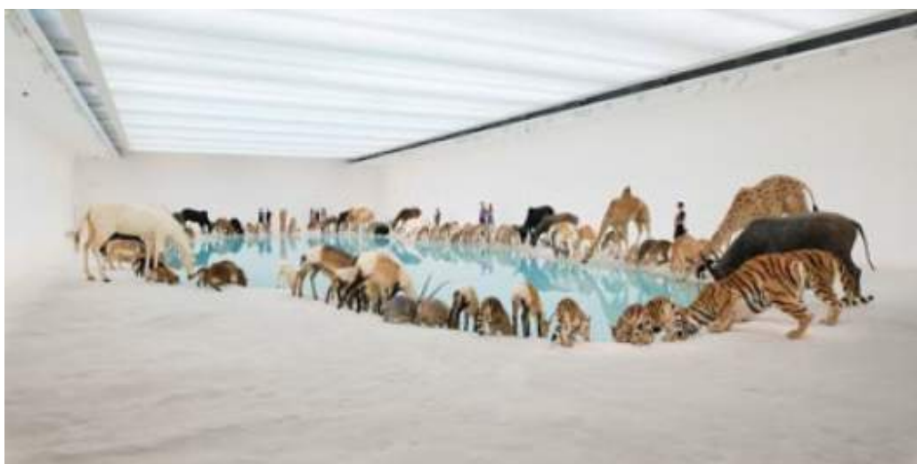
Installation view of Heritage at the Gallery of Modern Art, Brisbane, 2013.

In recent years, two major new works have extended this aspect of Cai's work, Heritage (2013), presented at the Gallery of Modern Art in Brisbane (pictured), seems to unite two strands within the museum-based side of Cai's practice. Like earlier pieces such as Inopportune: Stage Two (2004) and Head On (2006), it uses animals as symbols and presents a theatricalized and dramatic tableau that articulates ideas about nature and culture. Here 99 animals from around the world, including both carnivores and herbivores, gather together at the edge of a large watering hole and drink together. Man is conspicuously absent, and the scene seems edenic, a vision of a world in which all species peacefully co-exist, a kind of gallery-bound ark. In contrast, Silent Ink (2014), presented as part of Cai's exhibition The Ninth Wave at the Power Station for Art, Shanghai, consists of a 250 metre square lake excavated out of the gallery floor and filled with 20,000 litres of black ink. This is a monumental, spare and powerful work. Unaccompanied by drawings, the pool of ink is a singular object of contemplation, both mirror and void.