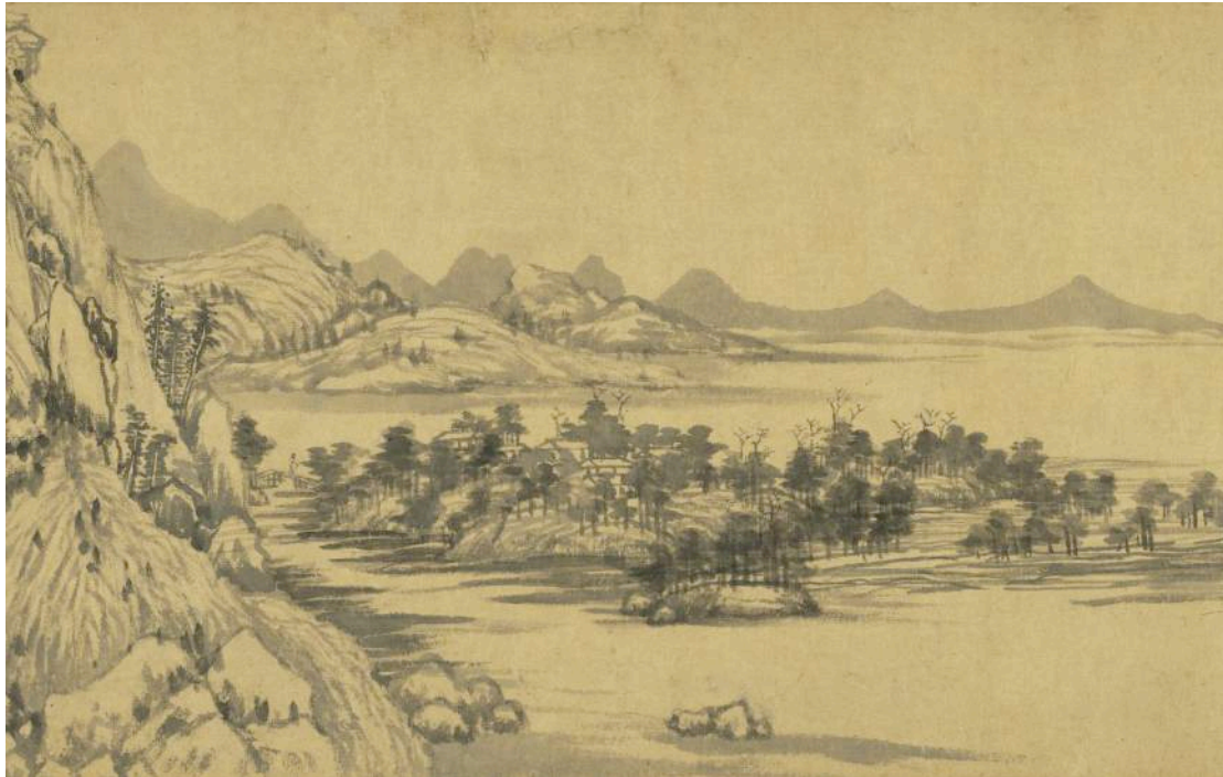
Huang Gongwang, Dwelling in the Fuchun Mountains , 1350, ink on paper

The composition of Unmanned Nature is taken from an iconic work of Chinese art, Dwelling in the Fuchun Mountains by Huang Gongwang (1269-1354), a scroll that is now in the collection of the National Palace Museum in Taipei (pictured). It is Huang Gongwang's masterpiece and a work renowned in the history of Chinese painting. The style of the handscroll reflects the fusion of calligraphic techniques with representational painting and is a preeminent example of literati art. It influenced landscape painting of the Ming and Qing dynasties and remains a well-known and treasured work of Chinese art.