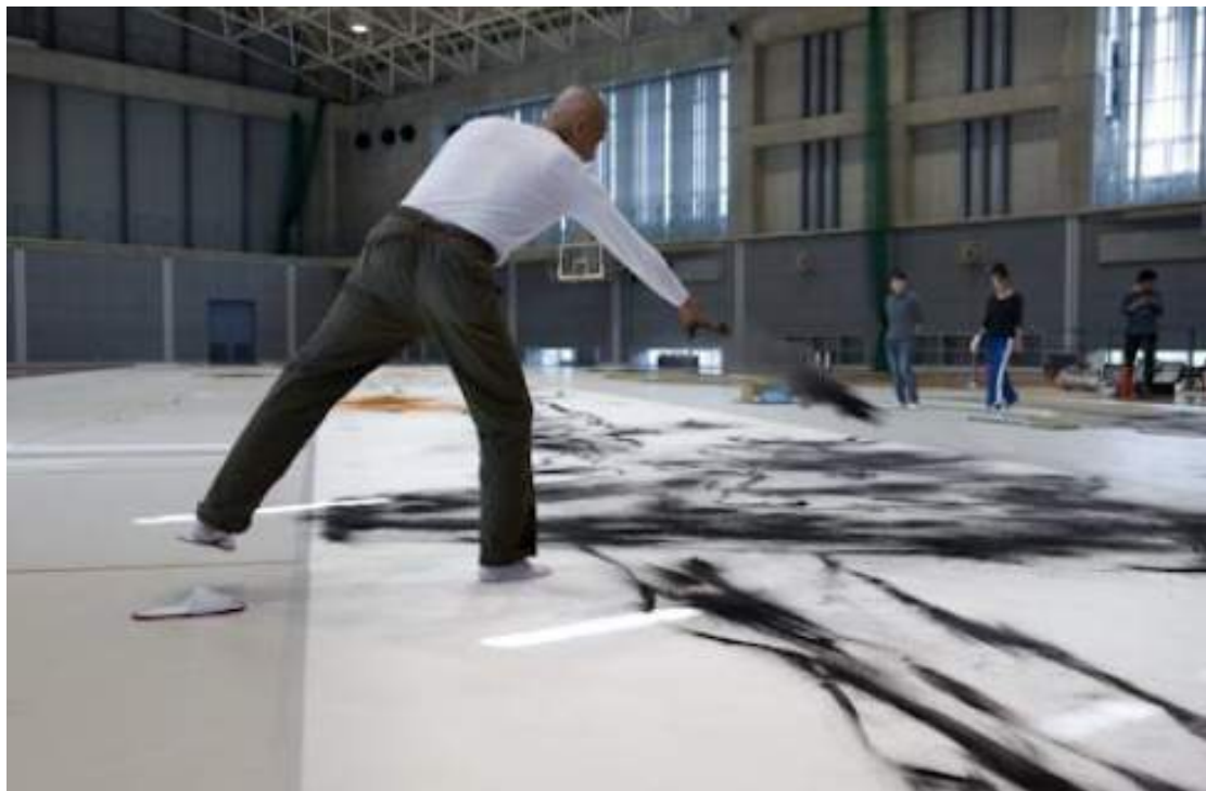
Cai Guo-Qiang making gunpowder drawing Unmanned Nature , Hiroshima, October, 2008.

Yet this scene is not located at the top of some lofty peak, but in a gallery of an art museum. It is an installation by the artist Cai Guo-Qiang and comprises a 45-metre long drawing depicting a Chinese mountain range with a huge sun hanging above it. The drawing hangs on a curving wall, forming an enclosing space. Before the drawing a pool of water fills the space, but for a wide walkway which follows the contours of the wall. Unlike most western landscape drawings, which, framed, offer a singular view of a given subject, or traditional Chinese drawings typically presented on scrolls and designed to be studied at close quarter, section by section, almost like a book, this installation can be experienced in a number of different ways. We might view the work from a distance, taking in the dramatic sweep of the mountainous landscape, and the corresponding reflection in the still water. Or we might enter into the space and move through it, promenading along the walkway and experiencing a changing sequence of views, perhaps occasionally stopping to look closely at a detail or the texture of the marks on the surface of the paper.