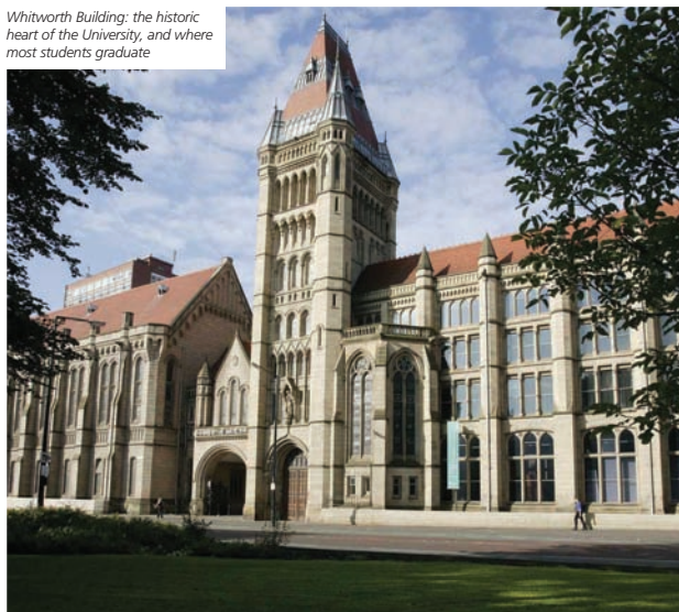
Whitworth Building: the historic heart of the University, and where most students graduate