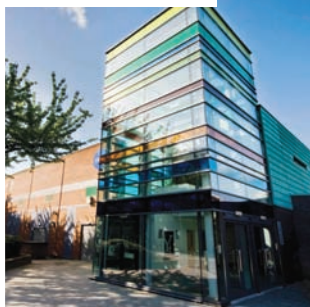
The Academy: one of Manchester's best live music venues