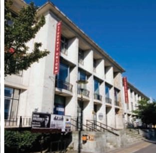
Students' Union: Student life: Amplified