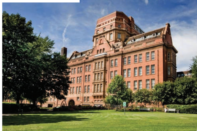
Sackville Street Building: just minutes from the city centre, and home to the Faculty of Engineering and Physical Sciences