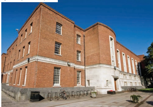
Main Library: lose yourself in one of the largest university libraries in Europe