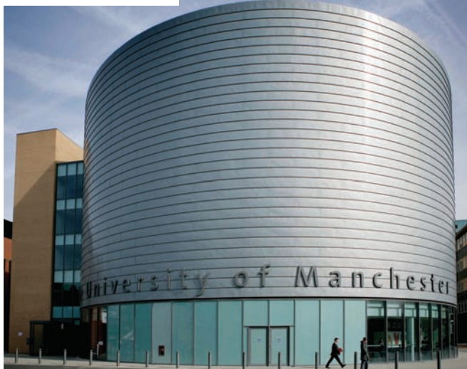
University Place: the centre of campus and home to The Atrium student services hub