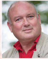
Louis de Bernières

Louis de Bernières, who lives in Norfolk, published his first novel in 1990 and was selected by Granta magazine as one of the twenty Best of Young British Novelists in 1993. Since then he has become well known internationally as a writer and his sixth novel, Birds Without Wings , came out in 2004. Captain Corelli's Mandolin (1994), won the Commonwealth Writers' Prize for Best Novel. A Partisan's Daughter 2008, was shortlisted for the Costa Novel Award and Notwithstanding: Stories from an English village came out in Autumn 2009. His first collection of poetry, IMAGINING ALEXANDRIA: Poems in memory of Constantinos Cavafis , is published by Harvill Secker in August 2013. As well as writing, he plays the flute, mandolin, clarinet and guitar. He was born in London in 1954