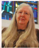
Eiléan Ni Chuilleanáin