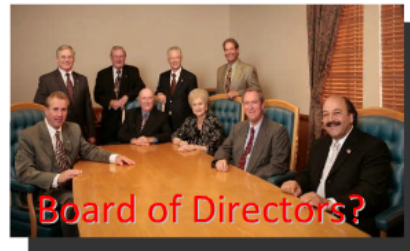
Board of Directors?