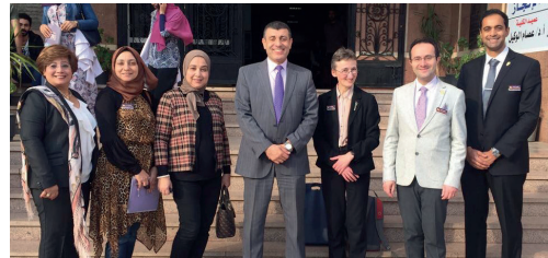
Visit to Mansoura Dental School Egypt as part of Mansoura-Manchester Dental Programme

Dentistry at Manchester promotes learning within the community, or 'service learning', as part of the curriculum, combining community involvement, academic study and practical experience. By working with community groups and schools as part of their dental degree, students provide essential healthcare for local people while increasing their social awareness and employability.