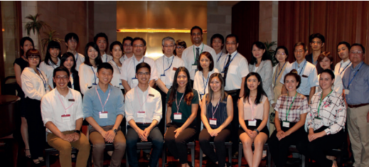
International exchange programme to Nippon Dental University Japan

Working across the globe in the name of dentistry is something we are proud of here at Manchester. As well as our social responsibility initiatives, we provide a number of exchange programmes in the USA, Egypt and Japan. This provides the opportunity for sharing experience and skills, ensuring our graduates are accomplished individuals.