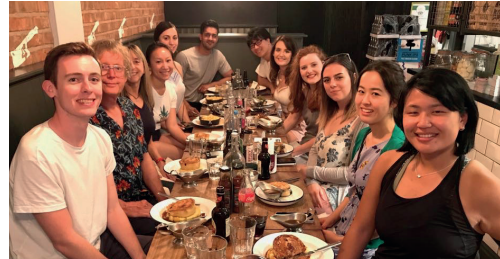
International student exchange programme