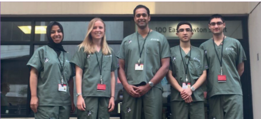
Undergraduate exchange programme to Henry M Goldman School of Dental Medicine Boston USA