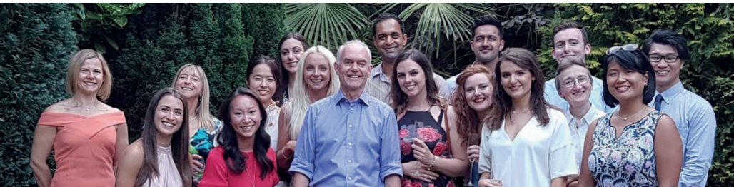
Welcome dinner with Dean - International exchange programme