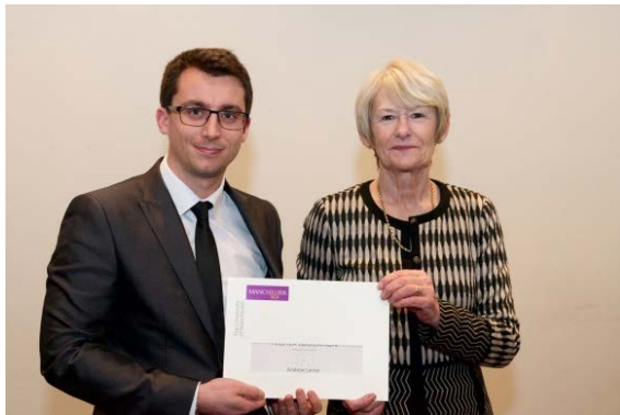
The President and Vice-Chancellor awarding a graduation certificate to a colleague in December 2017.

Its aim is to help you think more critically about your contribution to the University, as well as to develop a better understanding of the sector-wide changes in the Higher Education landscape. For example, in January 2018, we were delighted to host a Q&A event with The President and Vice-Chancellor. This allowed current and former participants to speak in detail about the issues pertinent to the HE sector covered by the programme. Over 100 of your colleagues have graduated from the PGCert in HE since 2014.