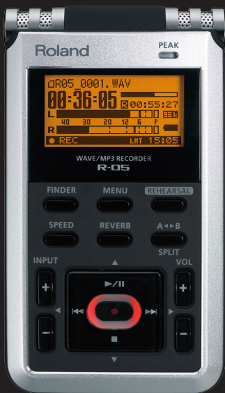
Roland R-05 Recorder Quick Guide