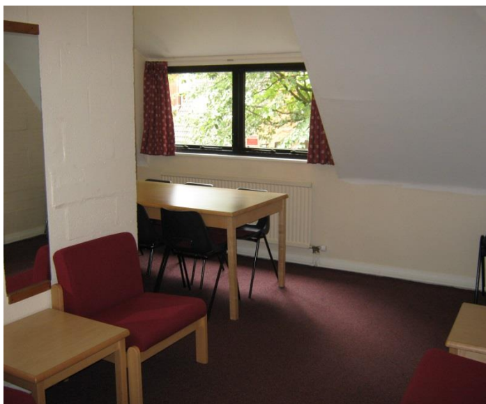
Lounge / Dining Area