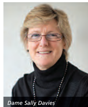
Dame Sally Davies