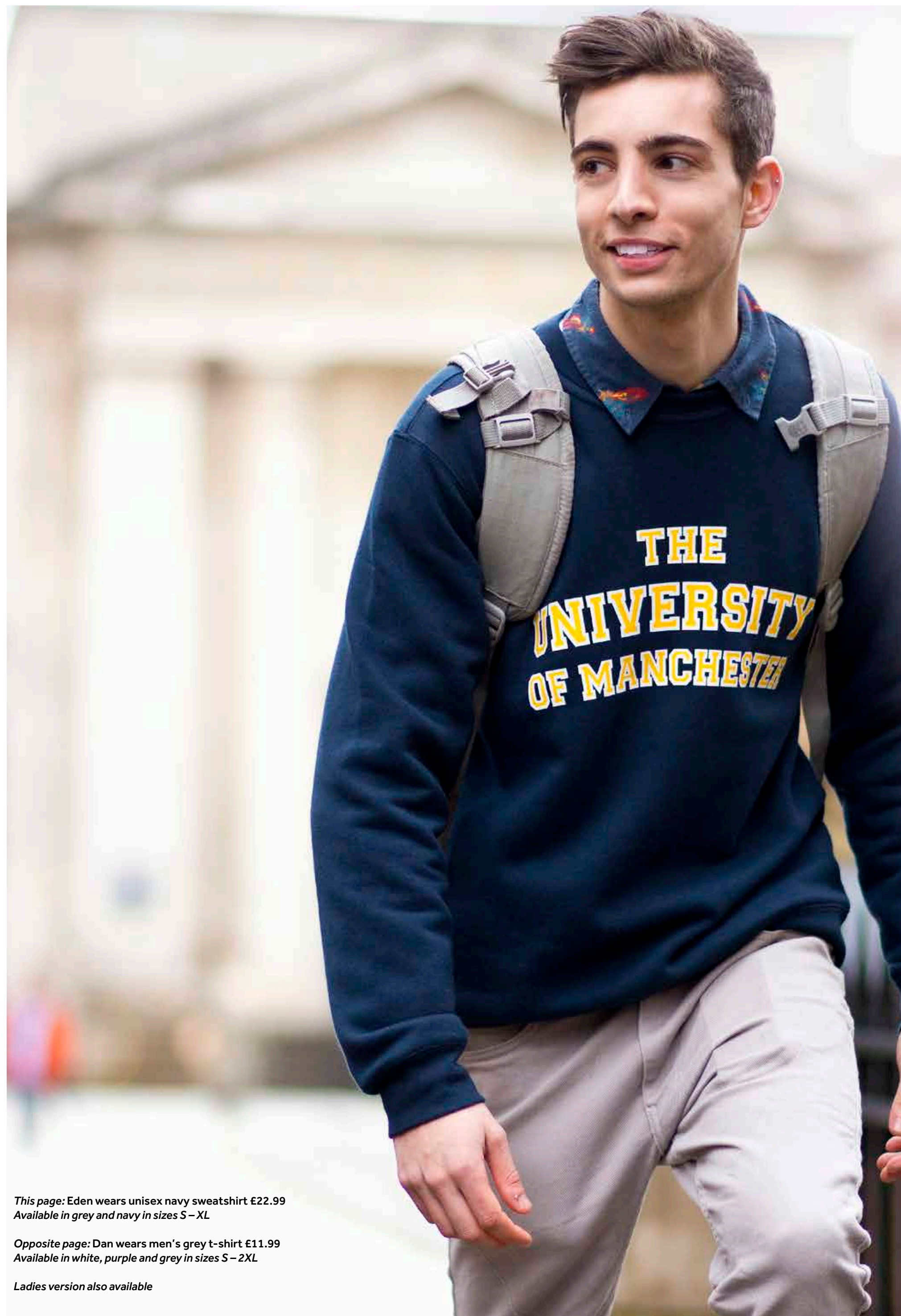
This page: Eden wears unisex navy sweatshirt £22.99 Available in grey and navy in sizes S – XL