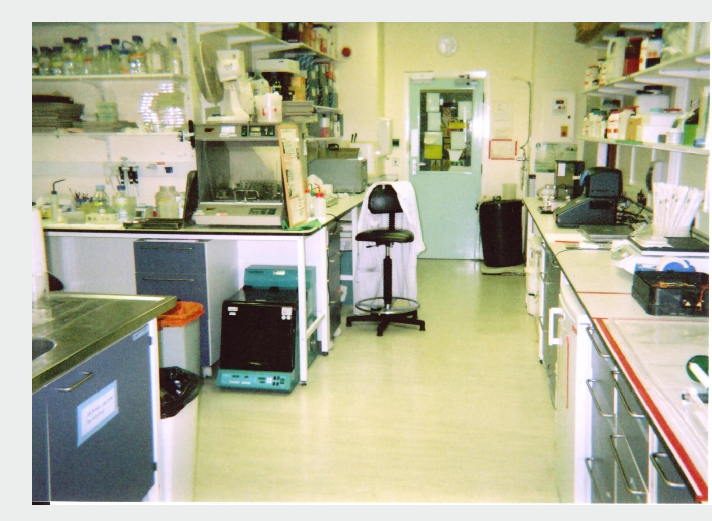
Figure 3

I think the peer review system works well if those people doing the review are themselves in a rather comfortable position. So you've got a permanent job, you've got your research funding and everything is working well, you don't have any threats, then I think you can touch other people's work in an objective way without putting your emotions and needs and desires into it. As soon as jobs become uncertain . . . post docs are our reviewers often and PhD students can be asked to do review as well. Because there are too few people to do refereeing. And these people are not really in a position, I think, to give an objective review.