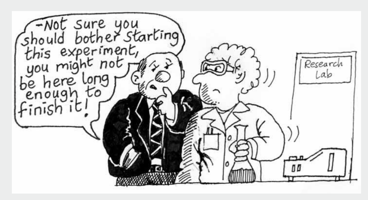
Figure 1 Cartoon from Union campaign

This reconfiguration of the relationship between science, government, and industry affects scientific labour markets and plays out differently for different scientists. Success as a scientist is never exhaustively determined by scientific criteria (Collins, 1985, Jasonoff, 2004). Workers are needed to provide the flexible workforce of 'mode 2' science and post-doctoral researchers often become 'trapped' (Lam, 2007, Smith-Doerr, 2006) as they are unable to acquire the necessary scientific capital of first authored papers and external research monies, creating "a burgeoning 'under-class' of contract workers" (Scott, 2007: 208). These processes add further complexity to pre-existing patterns of labour market segmentation.