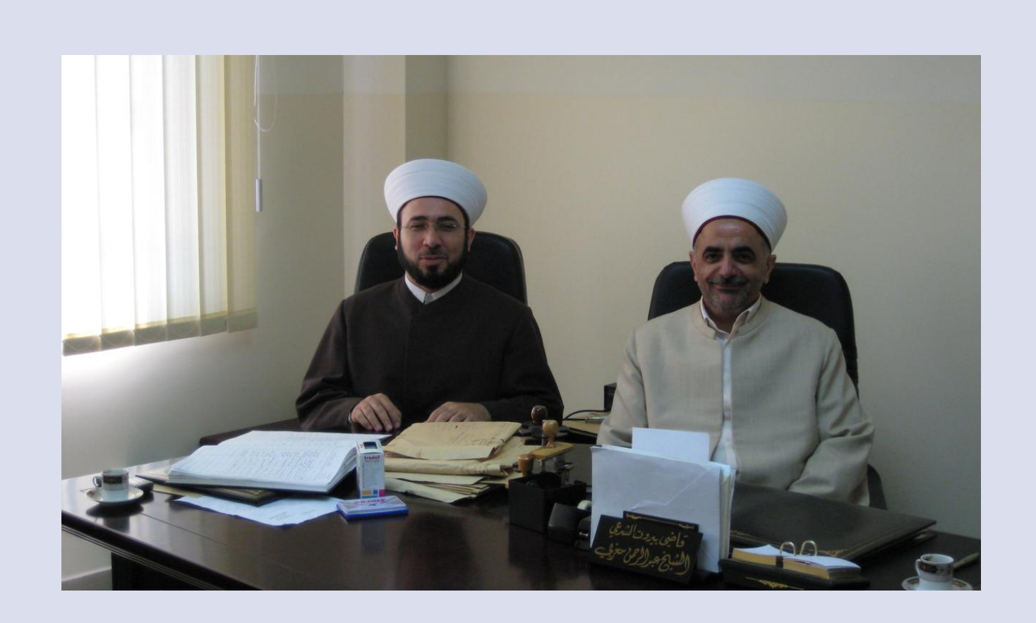
Figure 2 A judge and his recorder in a Lebanese (Sunni) shari'a court.