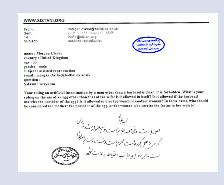
Figure 4 Reply from the offices of Ayatollah Sistani of Iraq to a query from the author, using the authenticating devices of handwriting and the offices' seal, sent as a scanned email attachment.

The proliferation of internet-based authorities such as Fadlallah necessitates new ways of anchoring personal religious authority. While at Manchester I have published a major research article documenting the ways in which the Shi'i Ayatollahs and their offices make use of digital scanning technology to reproduce signatures, seals and handwriting, in order to authenticate such correspondence (Clarke 2010).