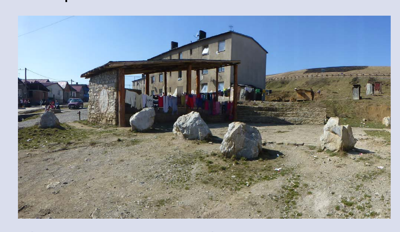
'Sheffield square' in one of the Slovak villages with many transnational Roma migrants

The project investigates under which specific spatio-temporal configurations, power relations and conditions do category of 'Roma' and 'Gypsy' crystallise as the most salient mode of categorisation in their destinations? To what extent, if so, are these categorisations racialised? How do these forms of racialisation relate to, and intertwine with, the ongoing racial formations developing in the British and Slovak contexts, as well as at the pan-European level?