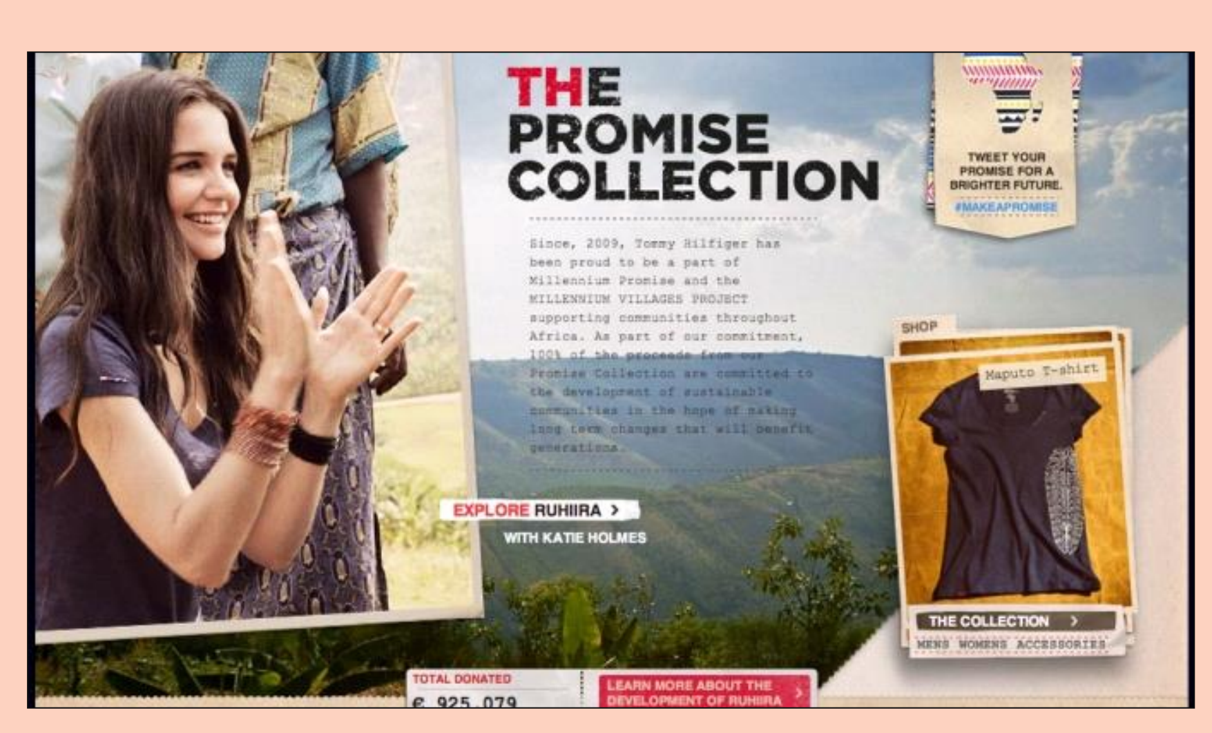
Hollywood actress Katie Holmes promoting Tommy Hilfiger's 'Promise Collection'

3.What is the nature of the ideal society that the Millennium Villages Project is attempting to create in 'model' form? What does this tell us about the ideological formation of contemporary global capitalism? To what extent is this ideal being realized, challenged, or subverted through its implementation within the Villages themselves?