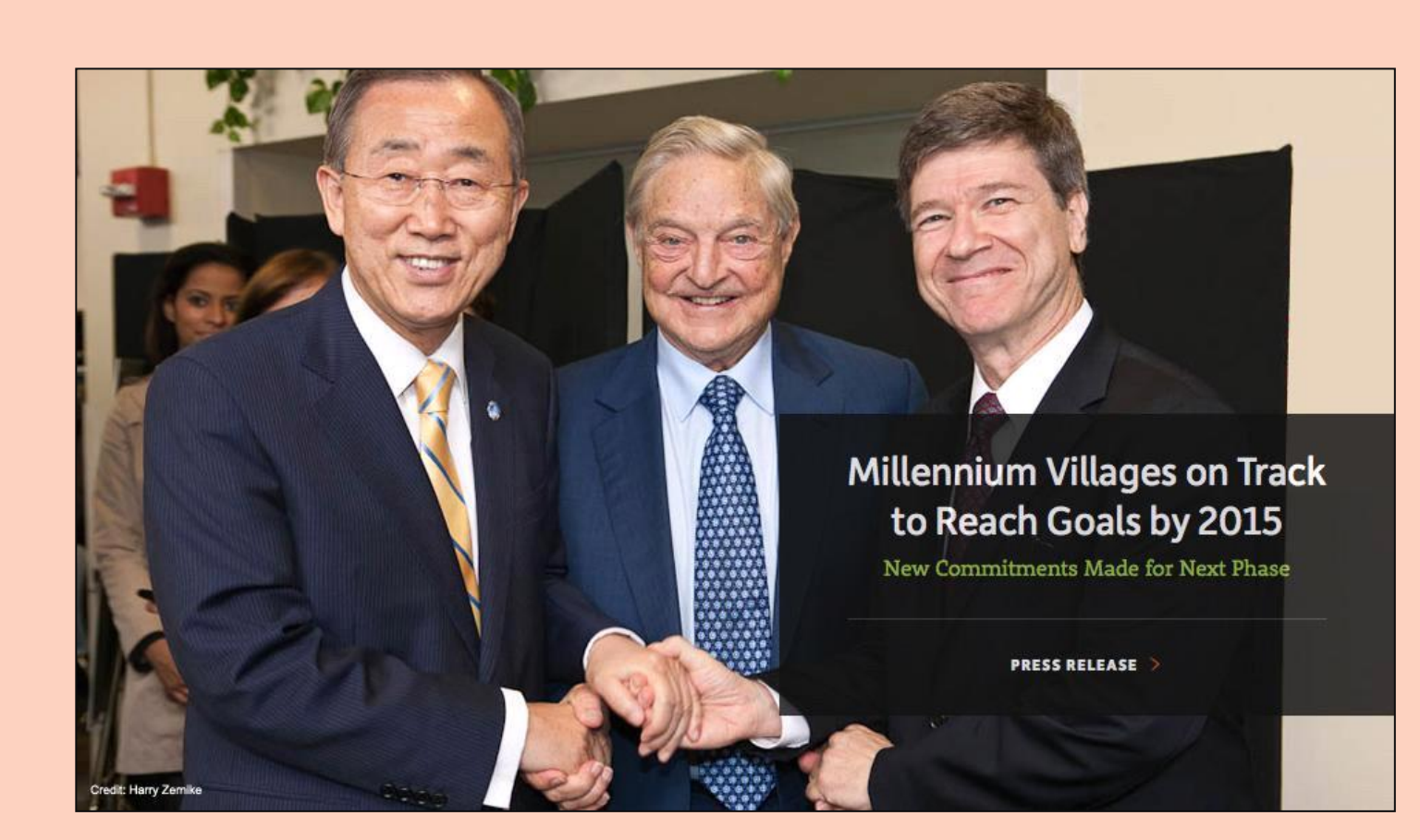
Ban Ki Moon, George Soros, and Jeffrey Sachs at the launch of phase two of the MVP in 2011

As such, the MVP embodies the complex nexus of public and private actors characteristic of contemporary global governance.